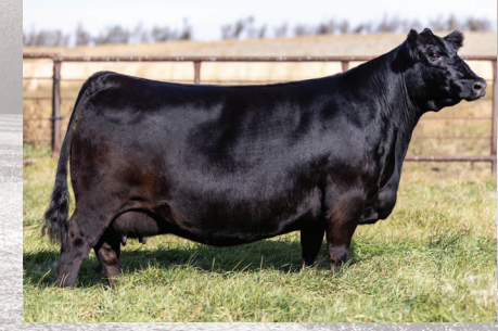
BAR-E-L BRIDE 28C . DAM