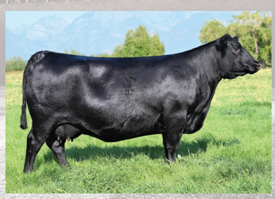
LAWSONS CHLOE C815 • MATERNAL GRANDDAM TO EMBRYOS AND PREGNANCY