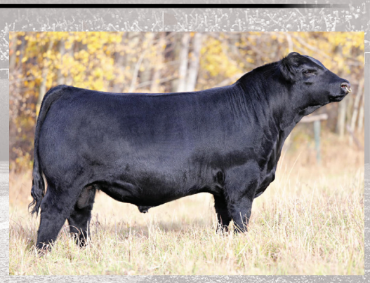
DMM GT LAST CALL 200J • SON OF YOUNG DALE KRISTINA 31D, BRED AT YDF